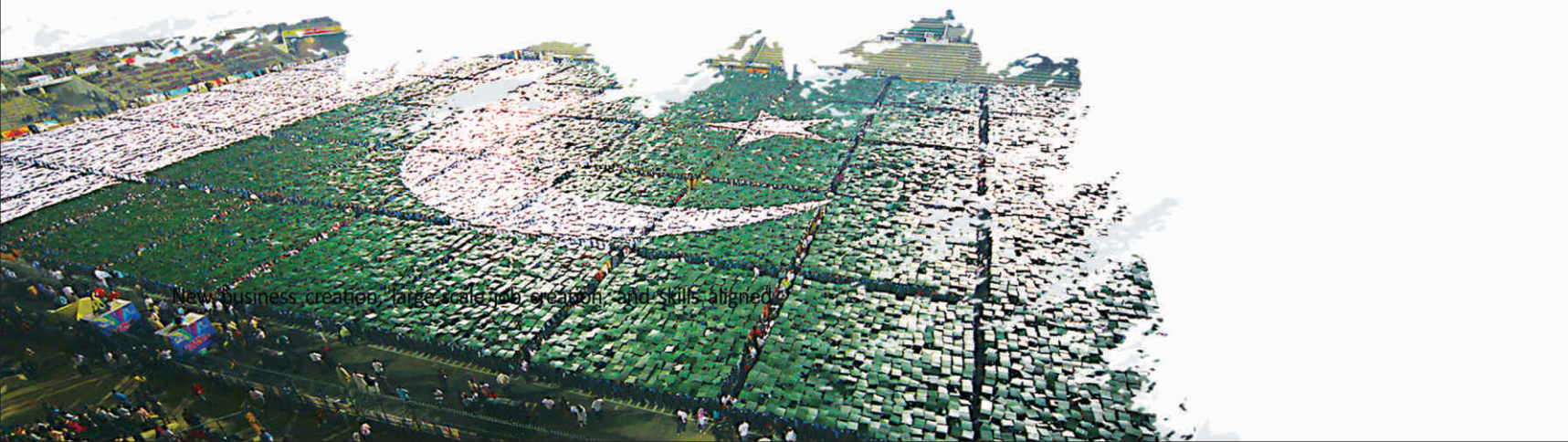
New business creation, large scale job creation, and skills aligned